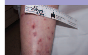
KL, start of treatment