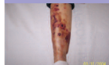
GL at start of Olivamine* skin care regime